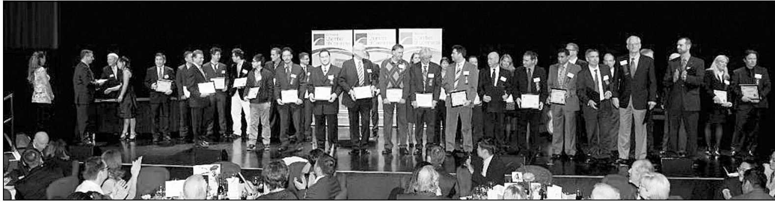
RiverRock Casino was the backdrop for this year's Gala. Congratulations to all of our Business Excellence Awards 2011 finalists and recipients.

On Wednesday, Nov. 23, the Richmond Chamber of Commerce recognized the best businesses over the previous year in Richmond, handing out eleven awards at its 34th annual Business Excellence Awards Gala.